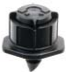
Mini Bubbler Barb 0.16"