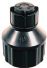
Mini Bubbler Thread 1/2"