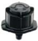
Mini Bubbler Thread 10-32 UNF