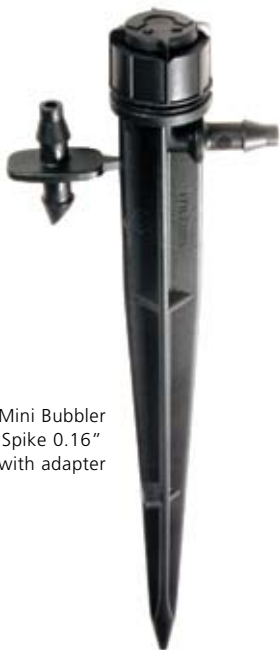
Mini Bubbler Spike 0.16" with adapter